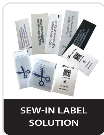
SEW-IN LABEL SOLUTION