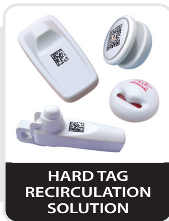
HARD TAG RECIRCULATION SOLUTION